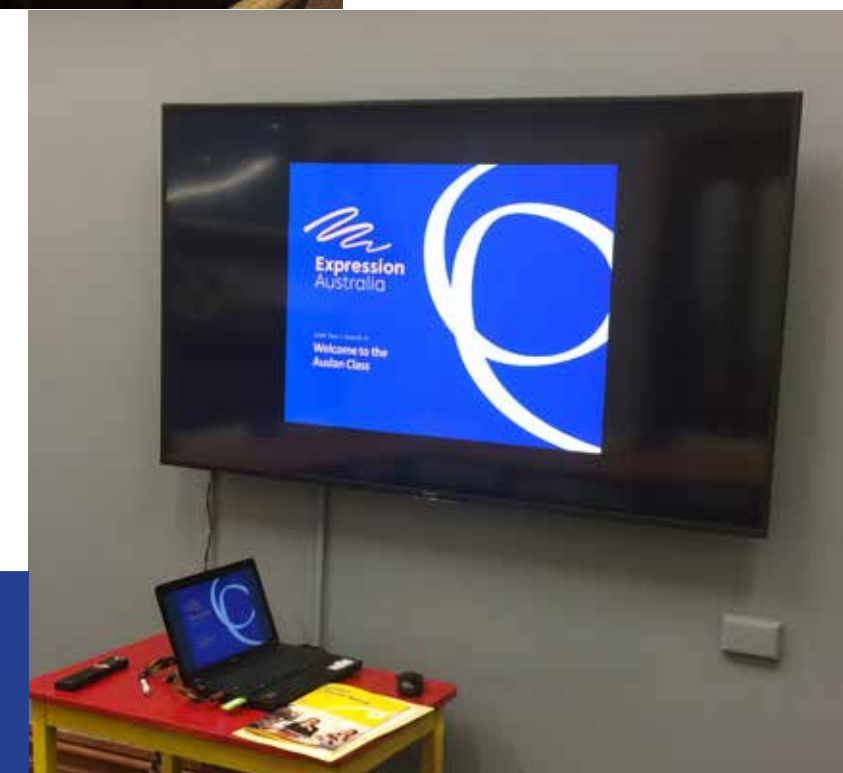
Right: New TV in Hobart office Community Room