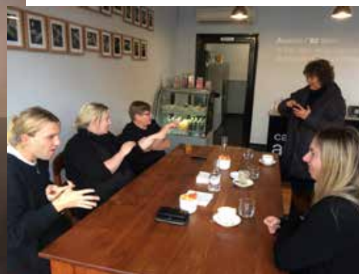
Left & top: Cafe Auslan in Battery Point